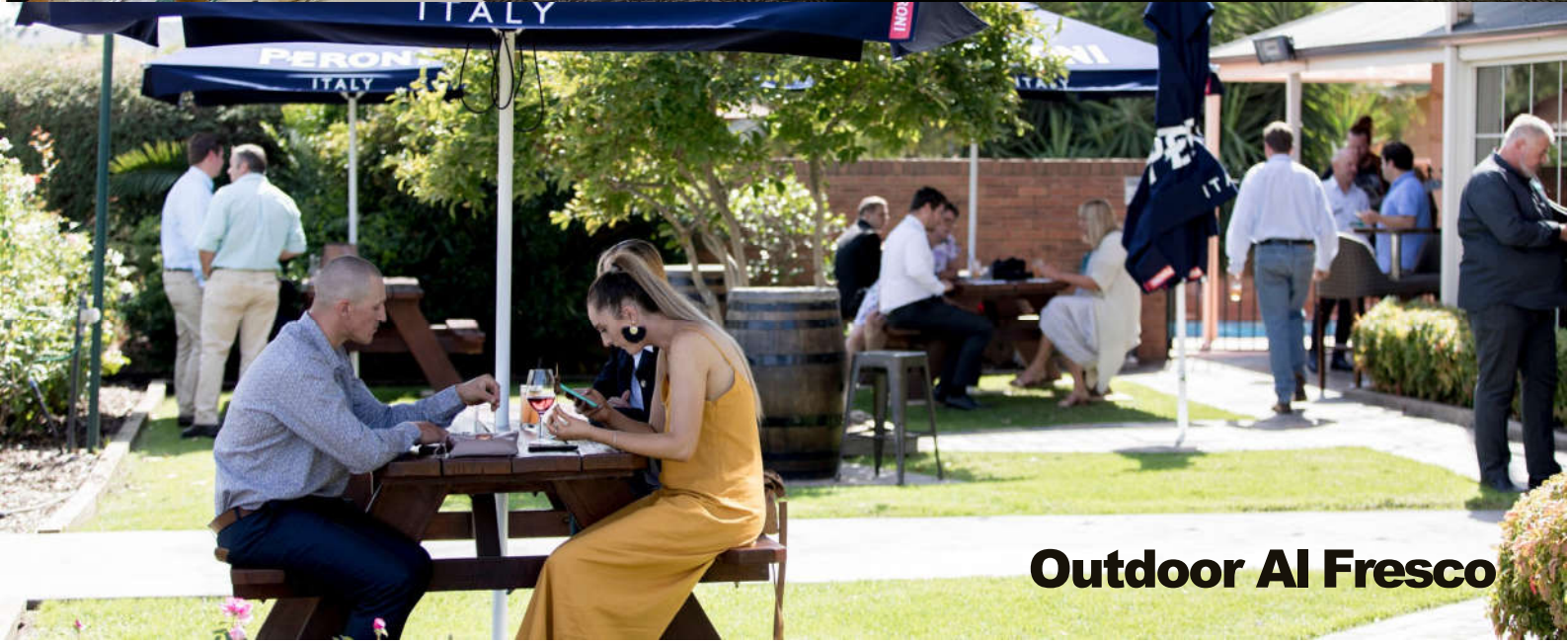
Outdoor Al Fresco